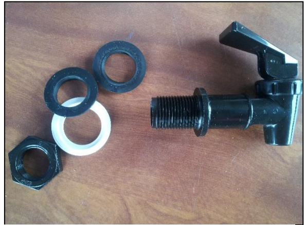
Flip-up faucet that can be retrofitted to your thermos.

The 'flip-up' faucet is manufactured by one company, Tomlinson, and is often called 'ceramic crock lever faucet.' There are many places online to purchase them, and home-brew and winemaking shops sell them too. If you have a ceramic crock that fits 5-gallon drinking water carboys, you probably already have one. Consider carefully the shipping charges for the faucets. MFMA's best find was on Amazon.com in their 'For Your Water' store, which charged us $1.50 per faucet and $5.35 for shipping for up to 10 faucets; meaning 10 faucets delivered was $20.35.